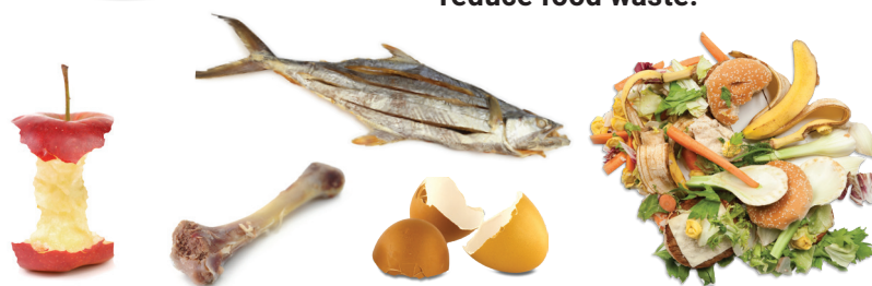
All Food Scraps: Fruits, Vegetables, Meat, Seafood, Bones, Shells, Dairy & Bread

Visit StopFoodWaste.org to learn how to reduce food waste.