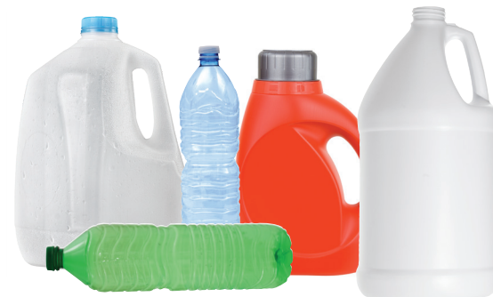
Rigid Plastic Containers