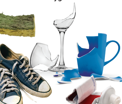
Other Household Items