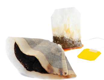
Coffee Grounds, Tea Leaves, Paper Filters & Teabags