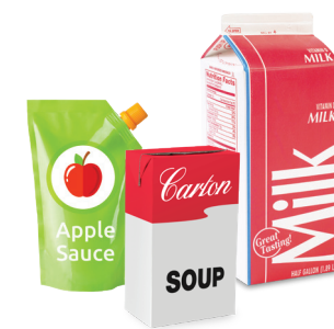
Lined Food & Beverage Cartons & Pouches

Non-Recyclable and Non-Compostable Items Only. Eliminate Single-Use Plastic Waste by Choosing Durable, Reusable Products.