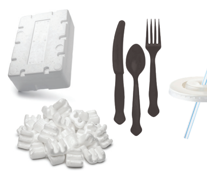
Plastic Utensils & Plastics Styrofoam Products