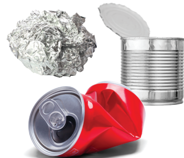
Metal Cans, Scrap & Trays