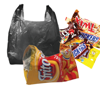
Plastic Bags & Wrappers, Snack Packaging