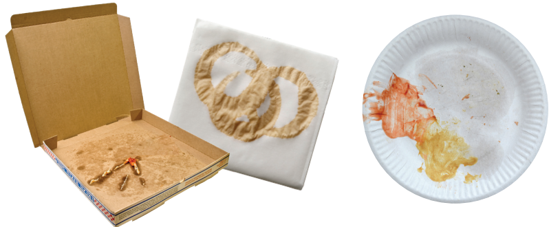
Food/Grease-Soiled Paper & Paper Products