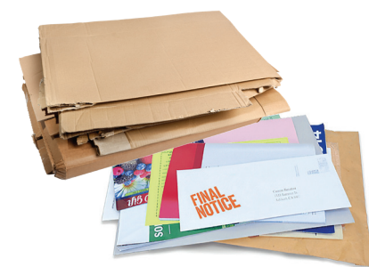
Cardboard & Mixed Paper

Keep Recyclables Clean, Dry and Empty. Do Not Bag Items.