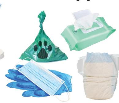
Diapers, Pet Waste & Personal Hygiene Products