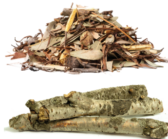
Yard Trimmings & Untreated Wood