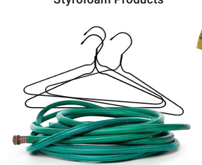
Hoses & Wires