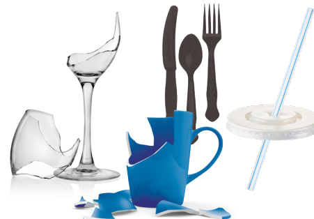
Broken Glassware & Ceramics Plastic Utensils & Plastics ♻️-♻️