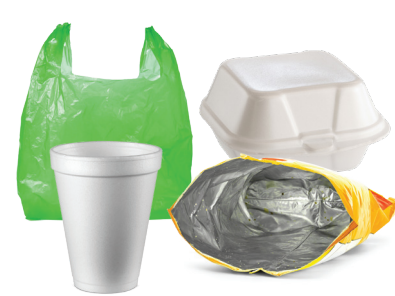
Plastic Bags & Wrappers Styrofoam Products