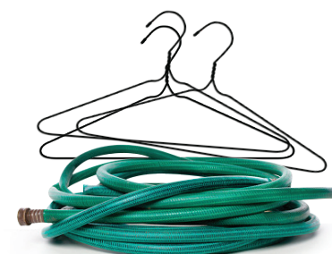
Hoses & Wires