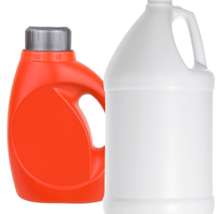
Rigid Plastic Containers ♻️-♻️