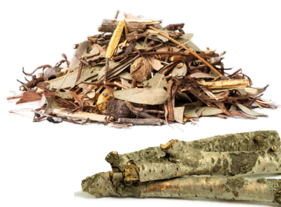
Yard Trimmings & Untreated Wood