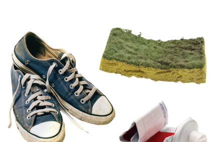
Other Household Items