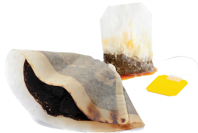
Coffee Grounds, Tea Leaves, Paper Filters & Teabags