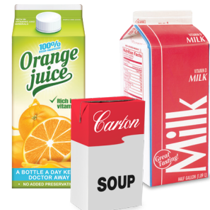
Lined Food & Beverage Cartons & Pouches

Non-Recyclable and Non-Compostable Items Only. Eliminate Single-Use Plastic Waste by Choosing Durable, Reusable Products.