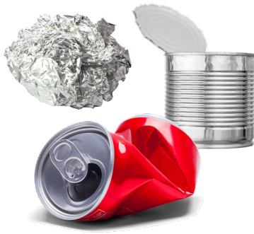
Metal Cans, Scrap & Trays