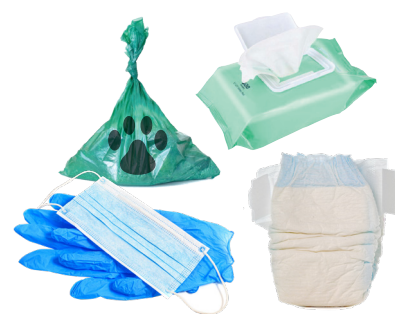
Diapers, Pet Waste & Personal Hygiene Products