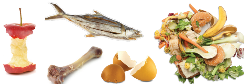
All Food Scraps: Fruits, Vegetables, Meat, Seafood, Bones, Shells, Dairy & Bread

Do Not Bag Items in Non-Compostable Plastics Bags. Visit StopFoodWaste.org to Learn How to Reduce Food Waste.