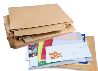
Cardboard & Mixed Paper

Keep Recyclables as Clean, Dry, and Empty As Possible. Do Not Bag Items.