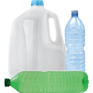
Plastic Bottles ♻️-♻️